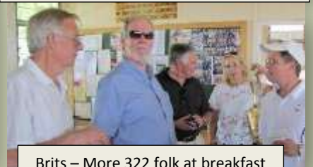
Brits – More 322 folk at breakfast