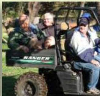
During the game drive