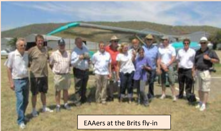
EAAers at the Brits fly-in