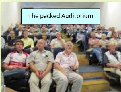
The packed Auditorium