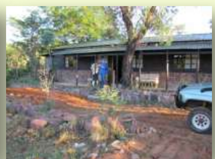
4 bedroom bush chalet