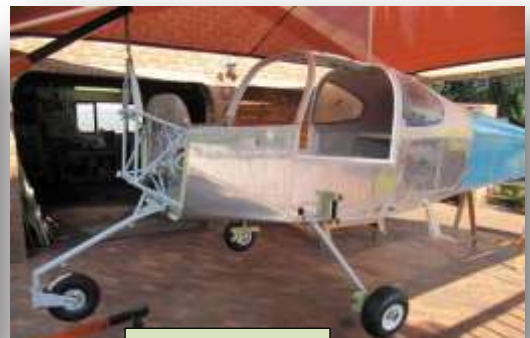
On the wheels