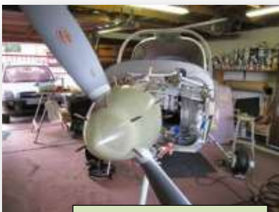
RV10 Engine installed

Conveners: Jonty Caplan - jontycaplan@gmail.com Justin Gloy - justingloy@gmail.com