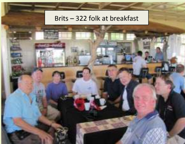
Brits – 322 folk at breakfast