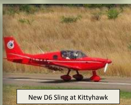
New D6 Sling at Kittyhawk