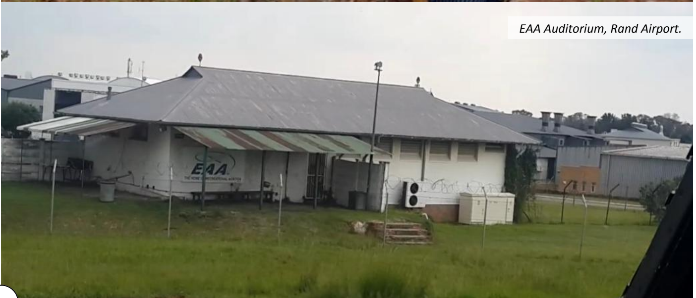
EAA Auditorium, Rand Airport.