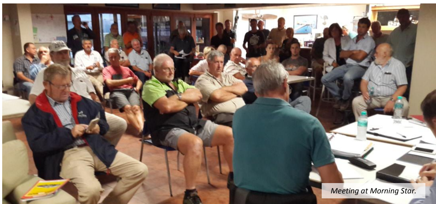
Meeting at Morning Star.

There is much work to be done and communications to follow. Hopefully there will be swarms of visitors from the Western Cape who will attend the 2016 EAA Convention at Mossel Bay.