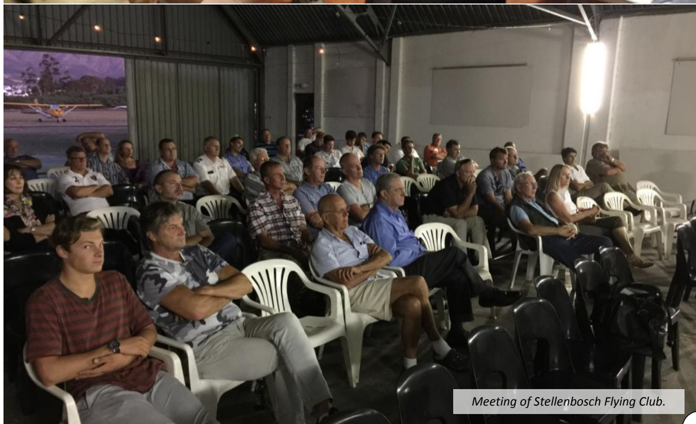
Meeting of Stellenbosch Flying Club.