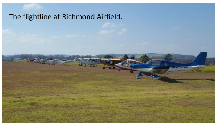
The flightline at Richmond Airfield.