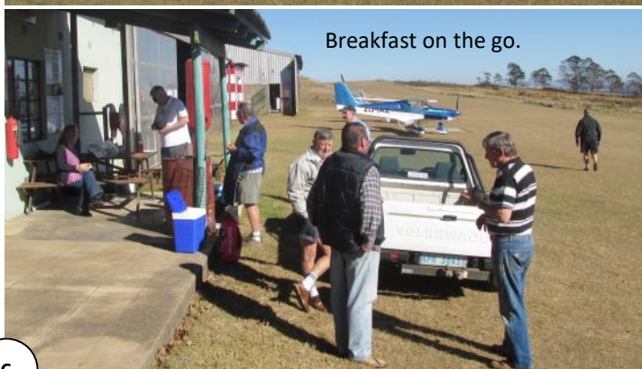
Breakfast on the go.