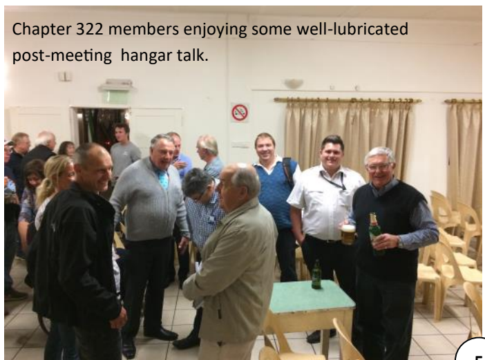
Chapter 322 members enjoying some well-lubricated post-meeting hangar talk.