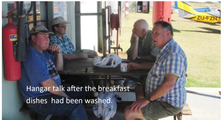
Hangar talk after the breakfast dishes had been washed.