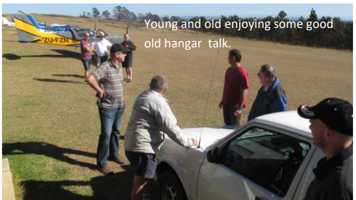
Young and old enjoying some good old hangar talk.