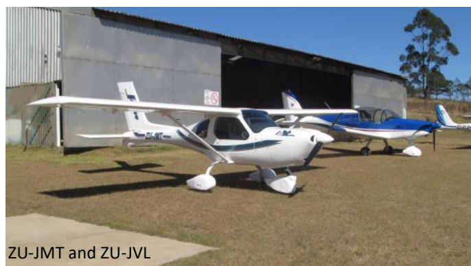
ZU-JMT and ZU-JVL