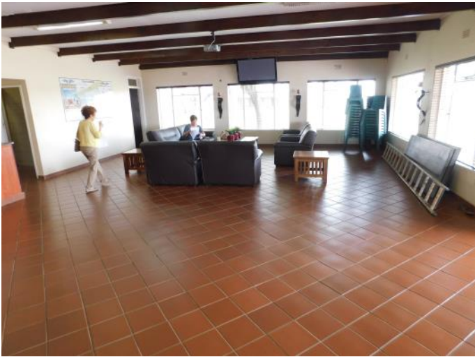
Rustenburg Flying Club clubhouse interior.