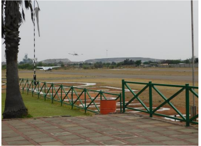
View of runway from the clubhouse.