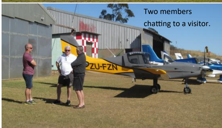
Two members chatting to a visitor.