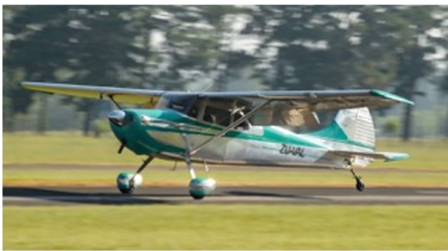
Of course the gallery would be incomplete without a shot of my 170 landing at Tedderfield