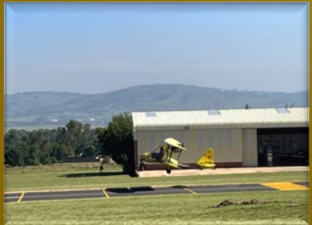
A perfect morning to enjoy the elements