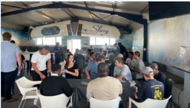
Teams battling it out in the quiz

Our young Aviator's event on Saturday, 27 January 2024 was a huge hit! We had almost 100 young Aviator's join for our first Introductory event for the launch of the community. We went over all the detail of what the community is about and how to become members as well as getting to know each other a little better by splitting into randomly selected groups for a general knowledge quiz on all things aviation related. Our top 3 teams won prizes and we also had a lucky draw at the end where we gave away some really awesome prizes to all those who signed up to become members.