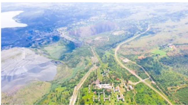
Cullinan Big Hole on the way to Tranquility