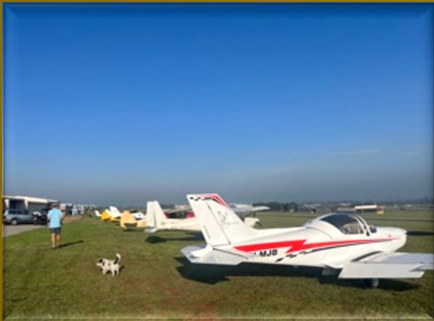
Seamus the flying dog making a b-line to the braai