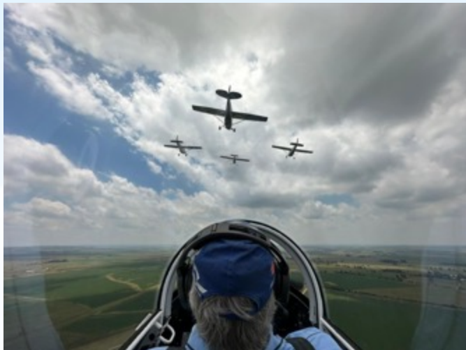
Camera ship view of the Cessna formation

The short notice precluded some of our other Cessna owners from joining. There were 4 Cessnas, a 140, my 170 and two 180s. The others that flew in were some of the who's who of airshow pilots. At departure time, a formation of the old Cessnas was planned and thoroughly briefed.