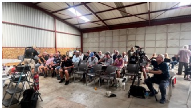
You could have heard a pin drop!