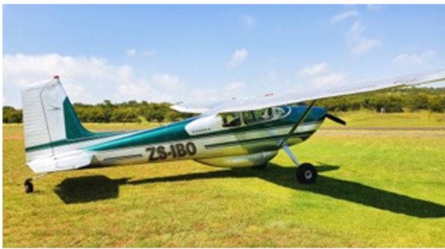
Nigel Hopkins 1957 Cessna 180 at Kitty Hawk