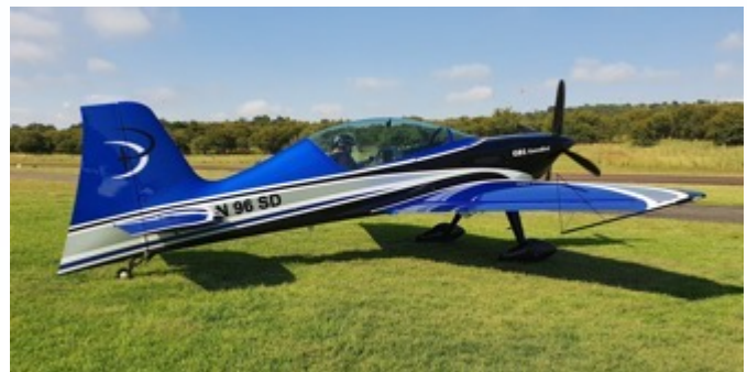
New Game Bird at Kitty Hawk