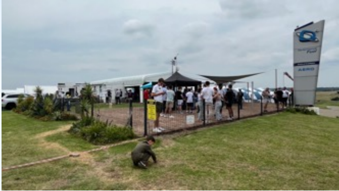
The Eagles Creek Clubhouse was buzzing with activity

Our young Aviator's event on Saturday, 27 January 2024 was a huge hit! We had almost 100 young Aviator's join for our first Introductory event for the launch of the community. We went over all the detail of what the community is about and how to become members as well as getting to know each other a little better by splitting into randomly selected groups for a general knowledge quiz on all things aviation related. Our top 3 teams won prizes and we also had a lucky draw at the end where we gave away some really awesome prizes to all those who signed up to become members.