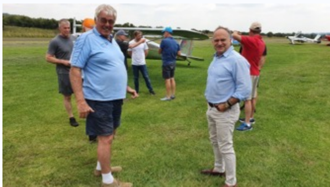
Kitty Hawk formation pilots

take-off. After landing I checked to see the results. The video was blank with a dead battery – bugga! On Saturday 27, the inaugural gathering and launch of the EAA Young Aviators initiative took place at Eagles Creek. The event attendance by enthusiastic potential young aviators and many others already involved in aviation, exceeded all expectations.