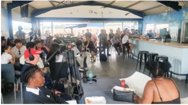
Rapt audience during a presentation at Eagles Creek