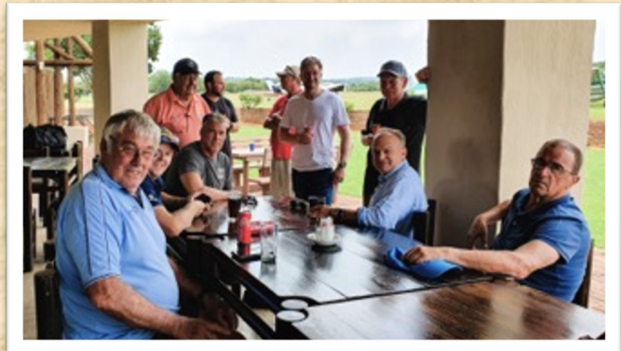
Kitty Hawk pilots for the Cessna fly-in