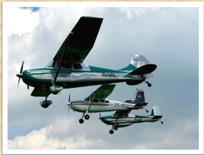
3 of the Cessna Formation from Kitty Hawk