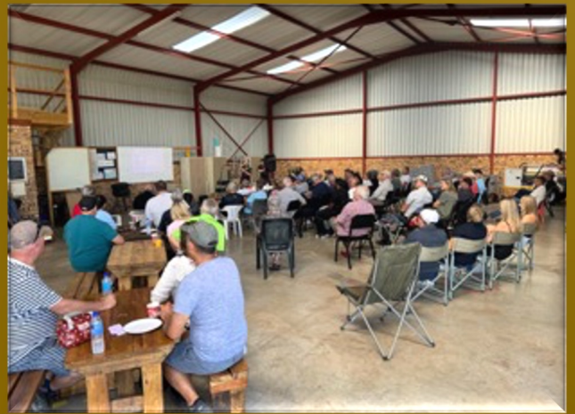
The great venue at FATA