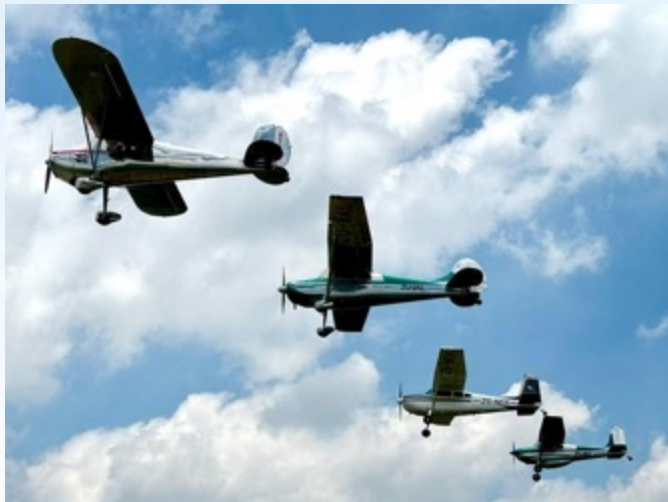
Cool Cessna range formation

The short notice precluded some of our other Cessna owners from joining. There were 4 Cessnas, a 140, my 170 and two 180s. The others that flew in were some of the who's who of airshow pilots. At departure time, a formation of the old Cessnas was planned and thoroughly briefed.