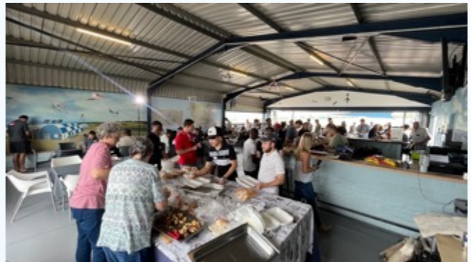
Sponsors donations covered all catering costs

this community. It's a great way to bring young blood back into the aviation environment. Our sponsors on the day were a great help getting the all our catering cost covered and our prize's sponsors gave away some really amazing things to our young aviators. Everyone seemed to enjoy the day and have already had many asking when the next event or fly-in will be happening. Can't wait to see how this community grows from here!"