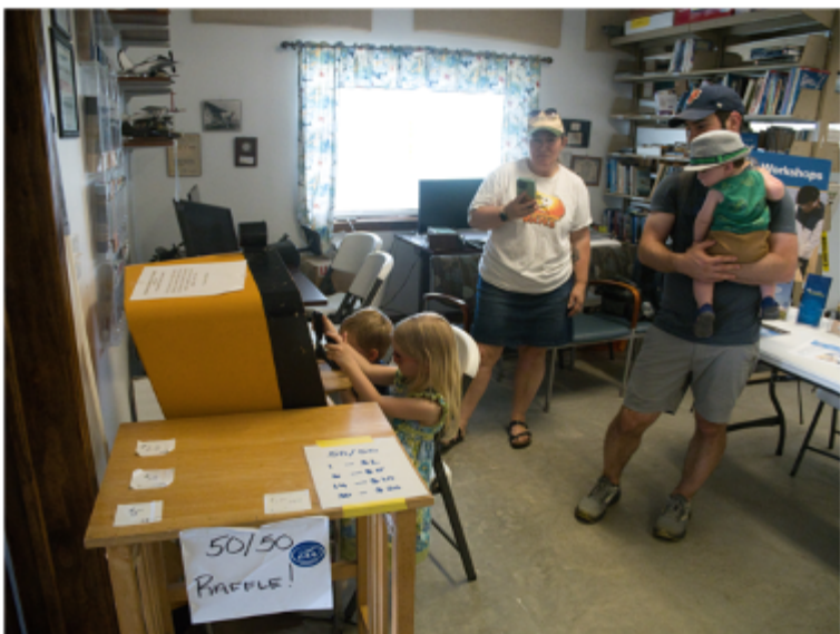
Young pilots at the flight simulator