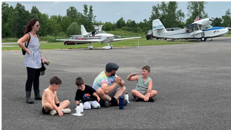
Son explain flight to his Dad.