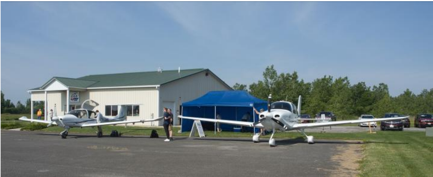
OnCore Aviation's Diamond and Cirrus