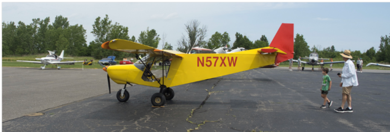
Moritz Wagner's Zenair Zenith 701