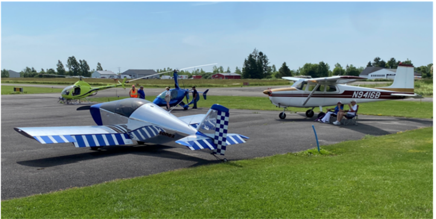
It was that kind of day, helo's, gyro's, Skylarks, and Sonex's.