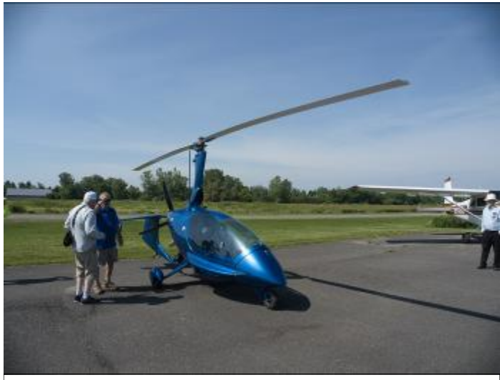
Norm & Elise Isler's ELA Gyrocopter.