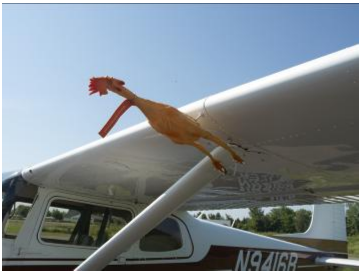
Who says aviation isn't fun???